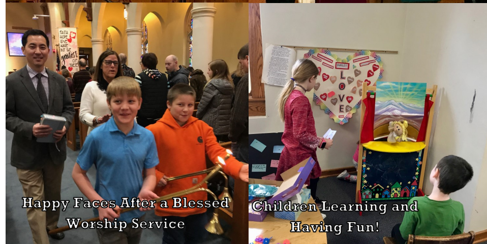
Happy Faces After a Blessed Worship Service