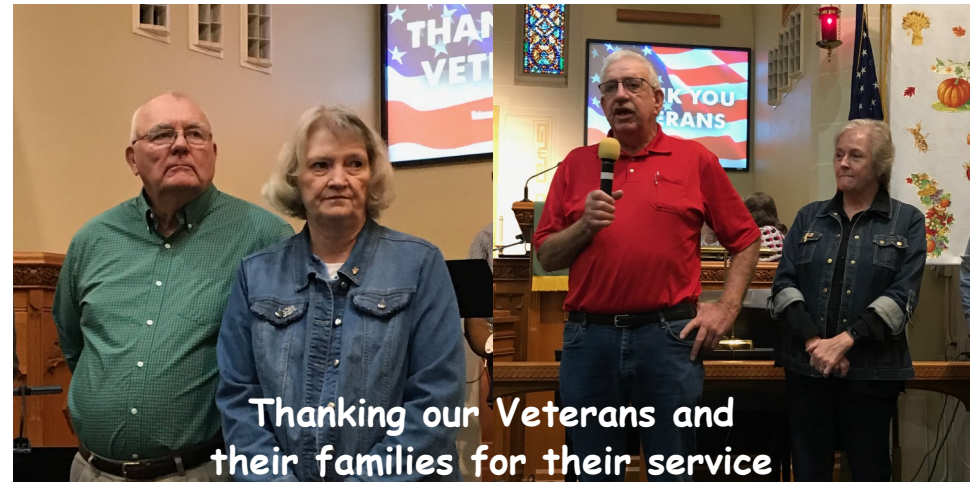
Thanking our Veterans and their families for their service