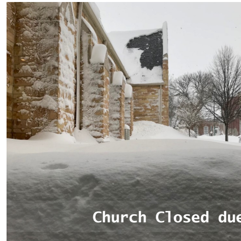
Church Closed due to April Blizzard