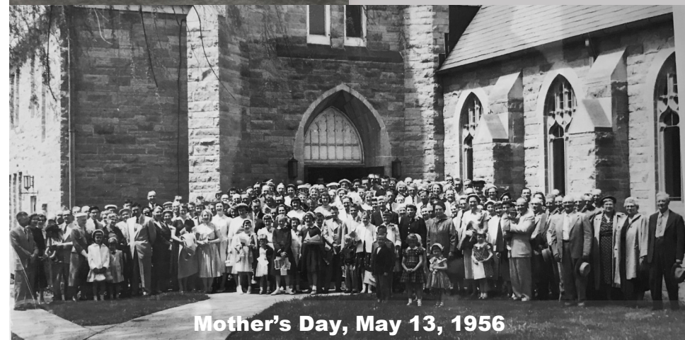
Mother's Day, May 13, 1956